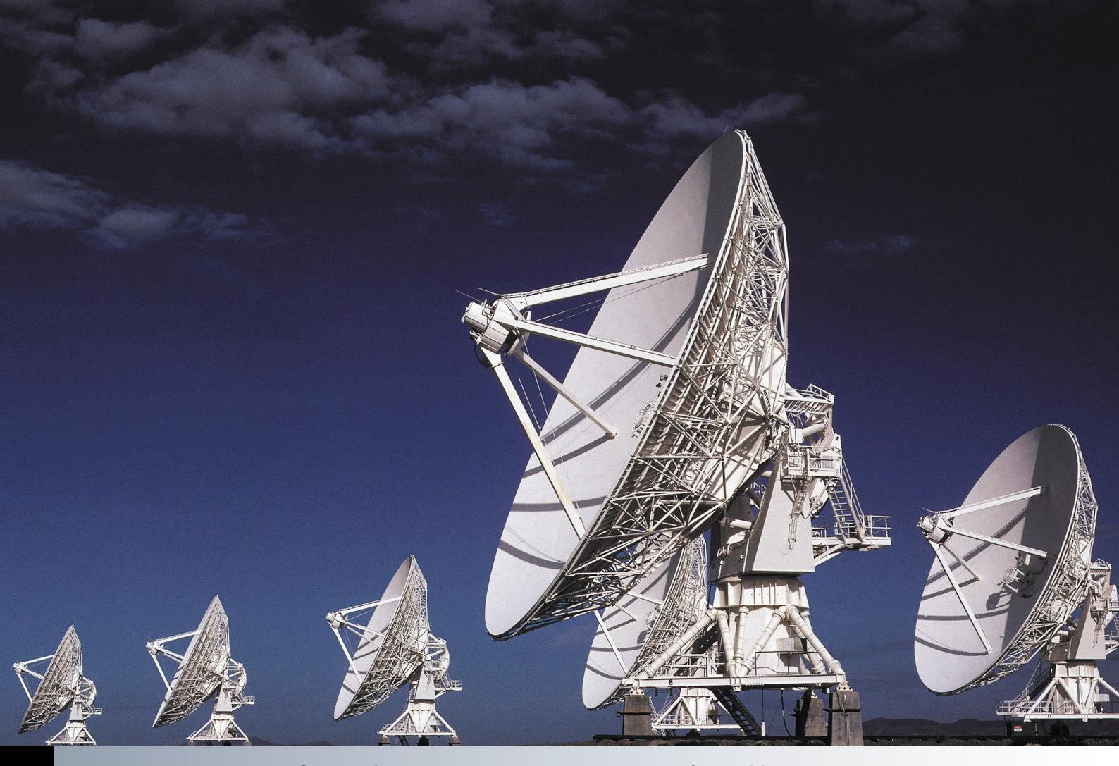
Seamless communication for Navision

Imaging that you are able to exchange data between Navision and solutions such as Microsoft SharePoint Server, Microsoft CRM, Mobile Solutions, Microsoft CMS or other .Net based Content Management Systems without any limitations. ALL Navision data and Navision functionality are available anywhere in the world! With VisionConnector you get real-time seamless access to all parts of Navision. VisionConnector works by use of Web Services, XML and Microsoft Message Queuing Services. Navision must be set up/adjusted depending on your specific needs in relation to sending online data between Navision and other solutions.